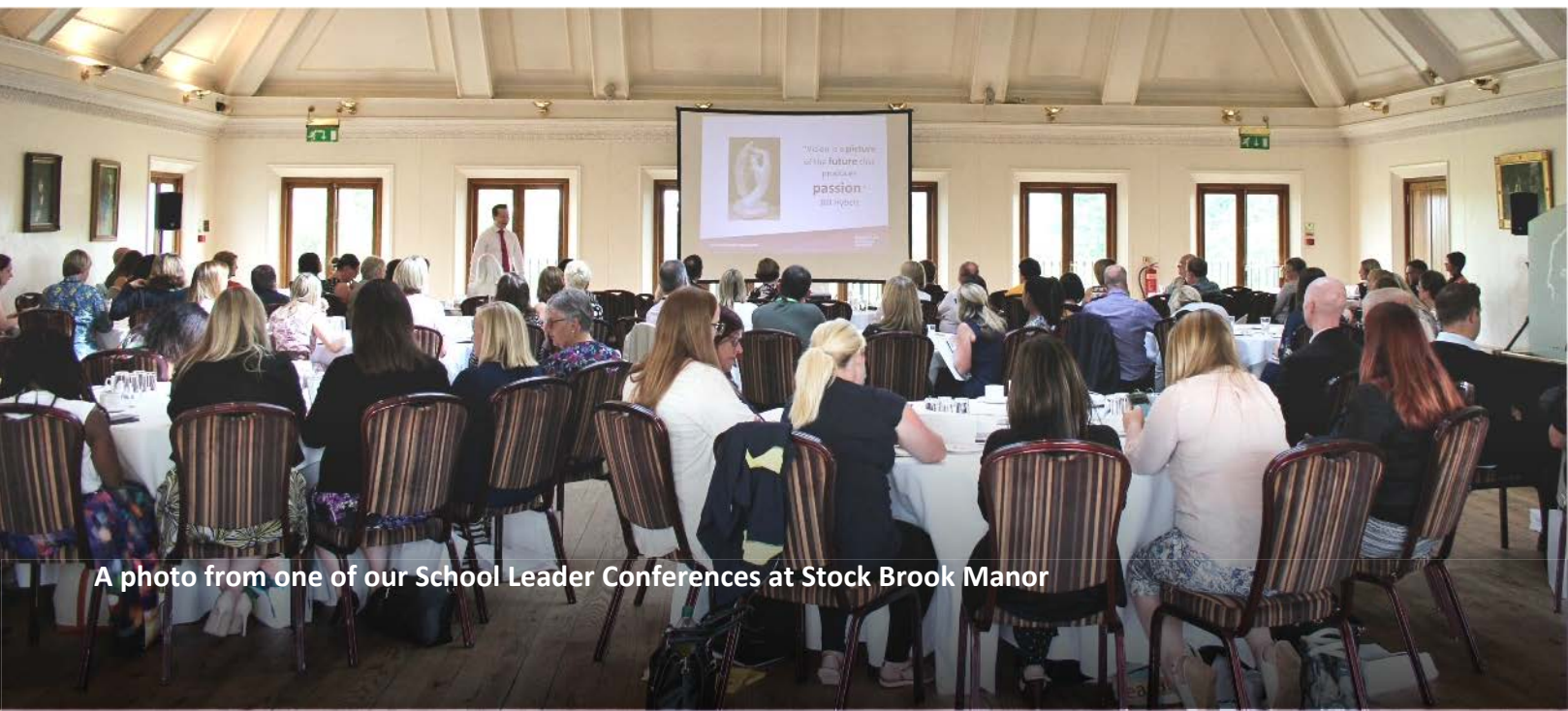
A photo from one of our School Leader Conferences at Stock Brook Manor